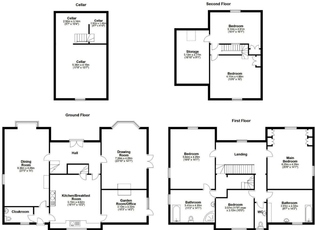
47, The Mount